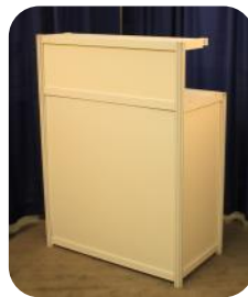
FOLDING LITERATURE RACK